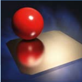
plating on glass