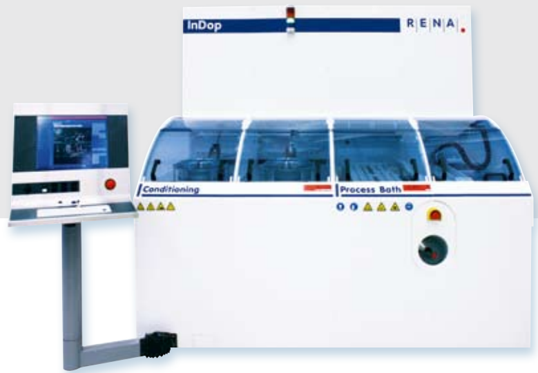
Front view InDop